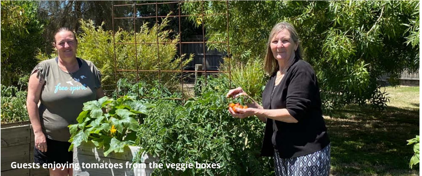
Guests enjoying tomatoes from the veggie boxes